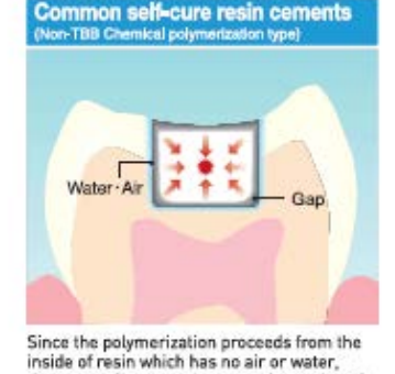
inside of resin which has no air or water, the gap easily occurs between the tooth and the resin.

Image: The polymerization mechanism behind Super-Bond™