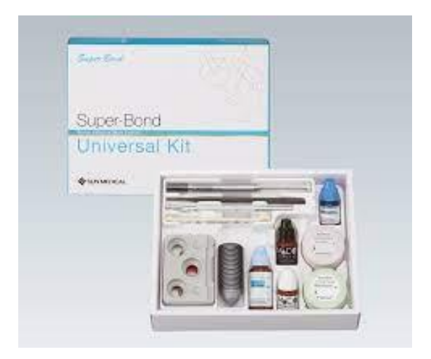
Image: Super-Bond<sup>™</sup>, now set to be sold in Brazil (actual product will differ from image.)

Employing 4-methacryloxyethyl trimellitate anhydride (4-META) as a dispersion-aiding monomer and tributylborane (TBB) as a polymerization initiator, Super-Bond<sup>™</sup> is an acrylic resin cement made for use as a dental adhesive. It is referred to in academic literature as a 4-META/MMA-TBB resin. SUN MEDICAL began producing and selling the product in 1982, and since sales first began in Japan, the material has become a favorite among dentists due to its excellent adhesive properties and ample track record of effectiveness. Super-Bond<sup>™</sup> finds use in a wide range of applications, including stabilizing mobile teeth, forming direct resin-bonded bridges, and enabling the adhesion of brackets and ceramic prostheses. The material enjoys widespread use in clinical settings around the world, with exports already going out to the U.S., Europe, China and South Korea.