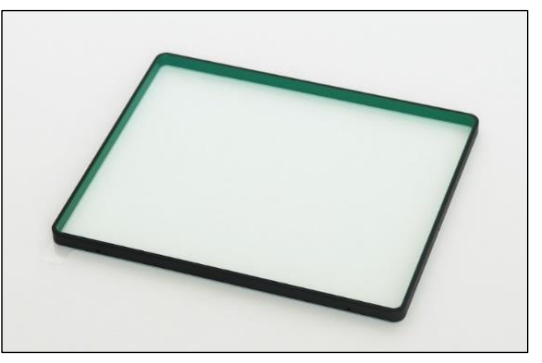
Product photograph of a pellicle

Reference: Mitsui Chemicals to Acquire Pellicle Business From Asahi Kasei (news release; May 27, 2022)