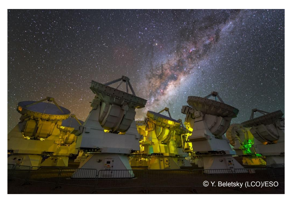
ALMA antennas observing space