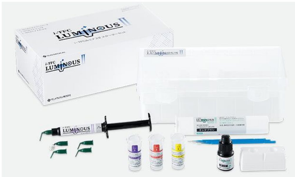
i-TFC™ Luminous II Starter Kit