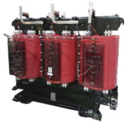
Biomass epoxy resin adopted for coils in extra-high-voltage molded transformers