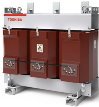
Biomass polycarbonate resin adopted for various plastic parts in 2026 Top Runner molded transformers