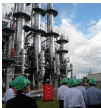
Plant tour for institutional investors

This award with its corporate disclosure evaluation system has implemented by SAAJ since 1995. Disclosure Study Group of SAAJ is to install evaluates disclosure of the quality, the amount, timing and so on along to the main items as follows.