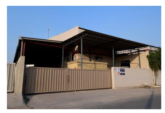
Testing lab exterior

The Mitsui Chemicals Group has previously built up a wide range of expertise relating to solar power generation. And based on this expertise, the group has fostered enough trust to be able to register a Bureau of Indian Standards (BIS)<sup>*2</sup> testing and certification lab before any other Japanese company. This lab will now be used for testing the performance and reliability of solar panels, allowing the Mitsui Chemicals Group to launch its business for BIS certification.