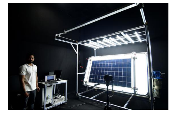
During a test