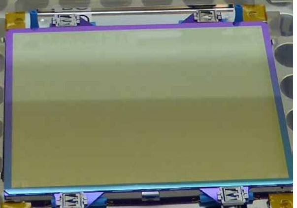
EUV lithography equipment