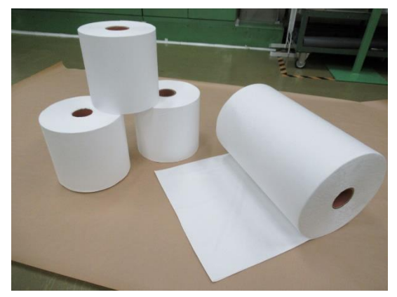
SYNTEX<sup>™</sup> nano roll

Mitsui Chemicals plans to further bolster and grow its nonwovens business going forward, with the newly announced facility expansion coming as one such move.