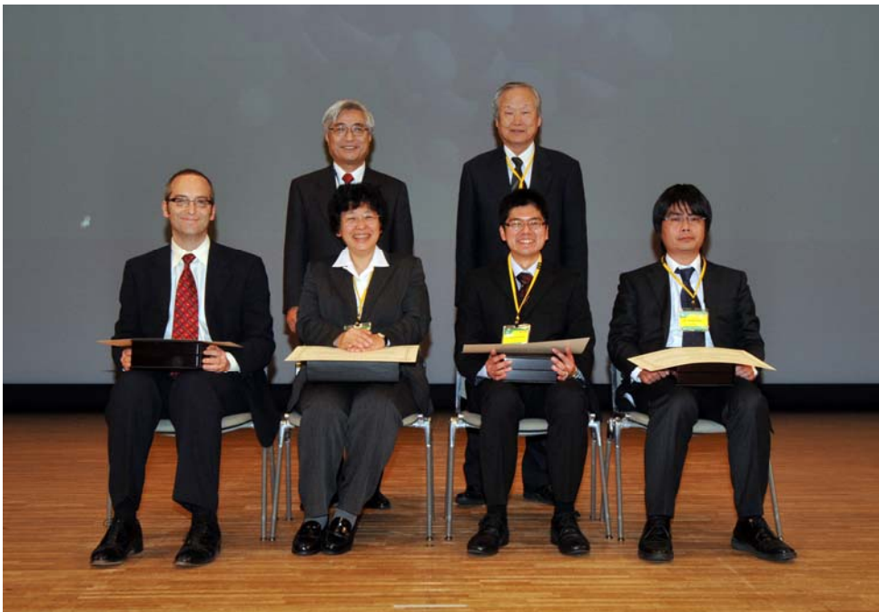
Winners of the “2009 Mitsui Chemicals Catalysis Science Award”