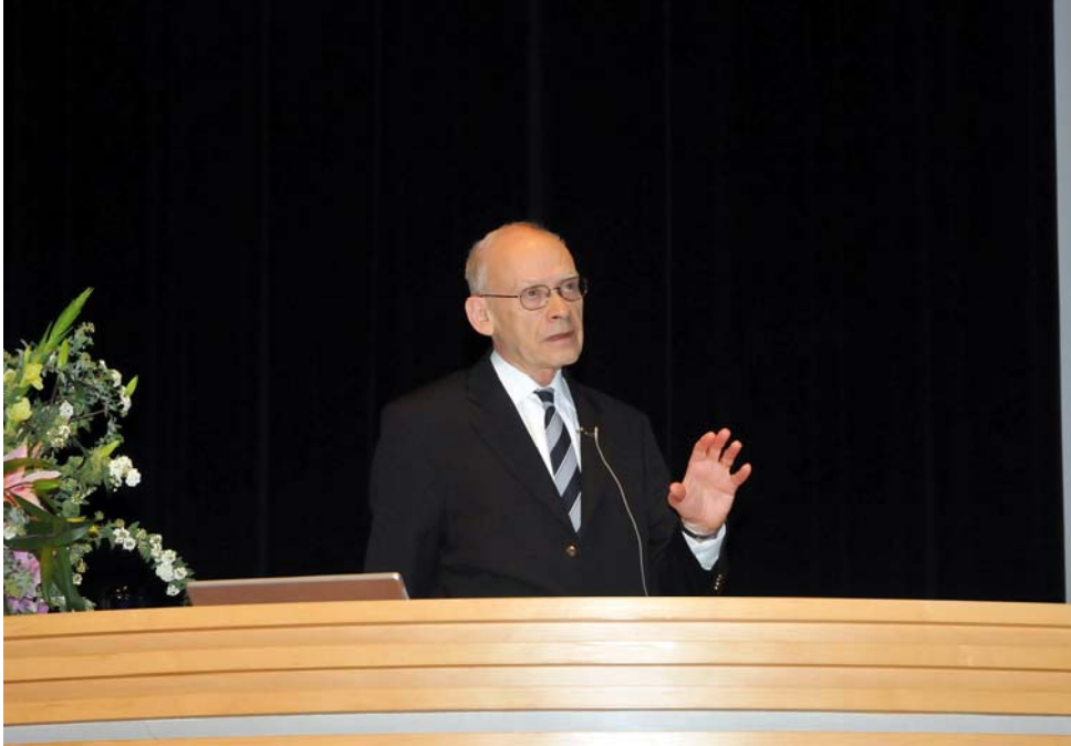
Plenary lecture ② Emeritus Prof. Henri B. Kagan