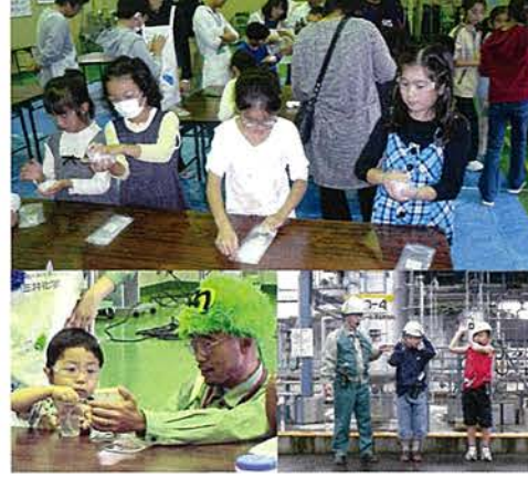
CSR activities (Social contribution)