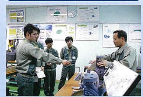
Learn by watching cutaway model

Training period : 1 day Capacity : 20 (10/group x2)