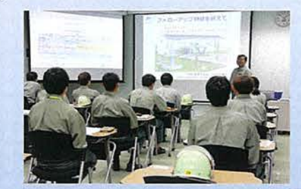
Lecture room (seating capacity 24)