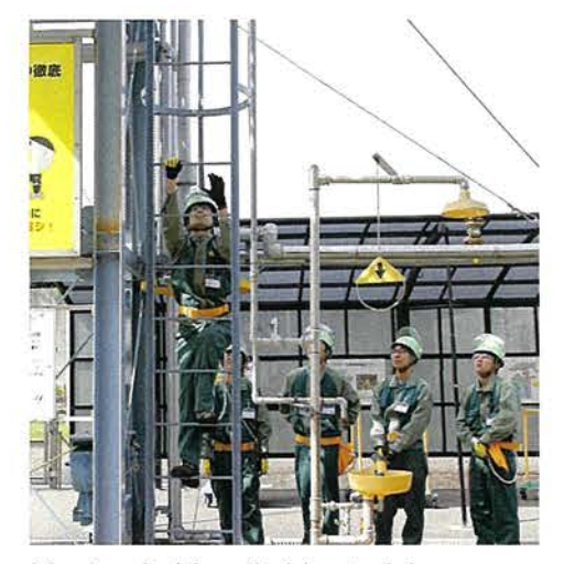
Monkey ladder climbing training