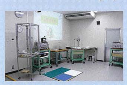
Static electricity experimental laboratory