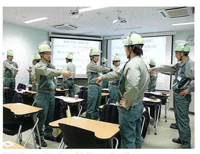
Pointing and calling (Uniform check)