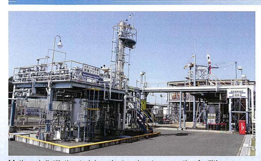
Methanol distillation training plant and water operation facilities