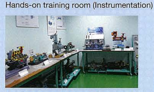
Hands-on training room (Machinery)