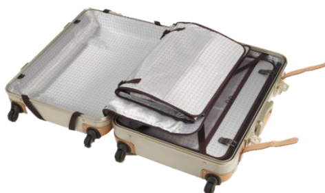
(Fabric: Copper Jacquard)

“Copper Stopper™”, developed with Mitsui Chemicals proprietary technology, is a new material coated by vapor deposition nano-coating technology in the thickness of 10 to 100 nanometers. Use of alloy technology resolves the problem of corrosion to which copper is prone.