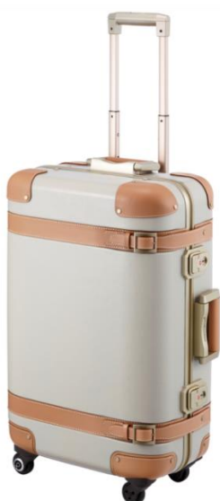
(Ace Co., Ltd. ProtecA GENIO CENTURY)