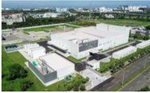
Bird's-eye view of Taiwan Tohcello