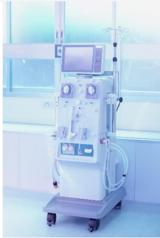
artificial dialysis machine